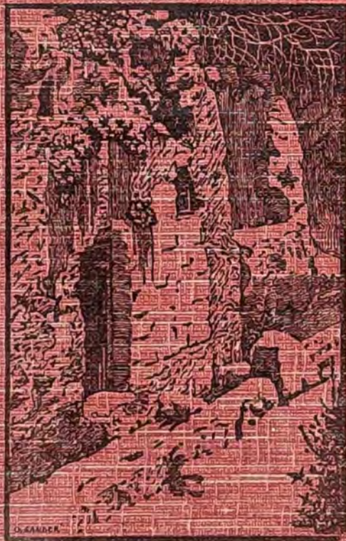
ENTRANCE TO GARDEN TOMB