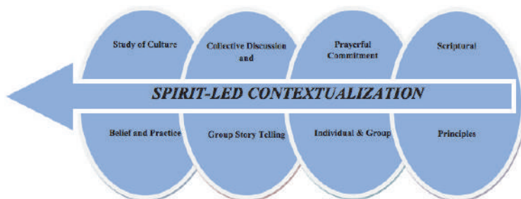
Figure 2. Role of the Spirit in Contextualization Among Malawi Assemblies of God Pastors.