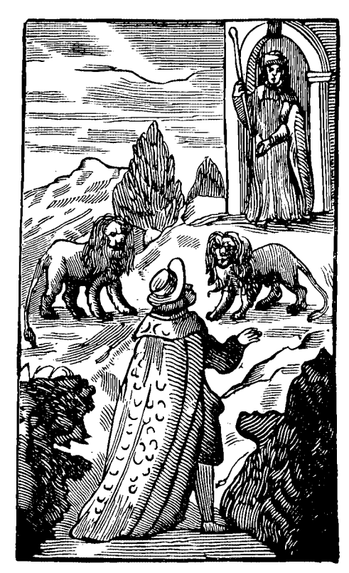
Difficult is behind Fear is before, Though he's got on the Hill, the Lions roar; A Christian man is never long at ease, When one fright's gone, another doth him seize.

The illustrations (of which, by the kindness of the Publisher, we are able to give two examples,) are copied from the fifth and subsequent