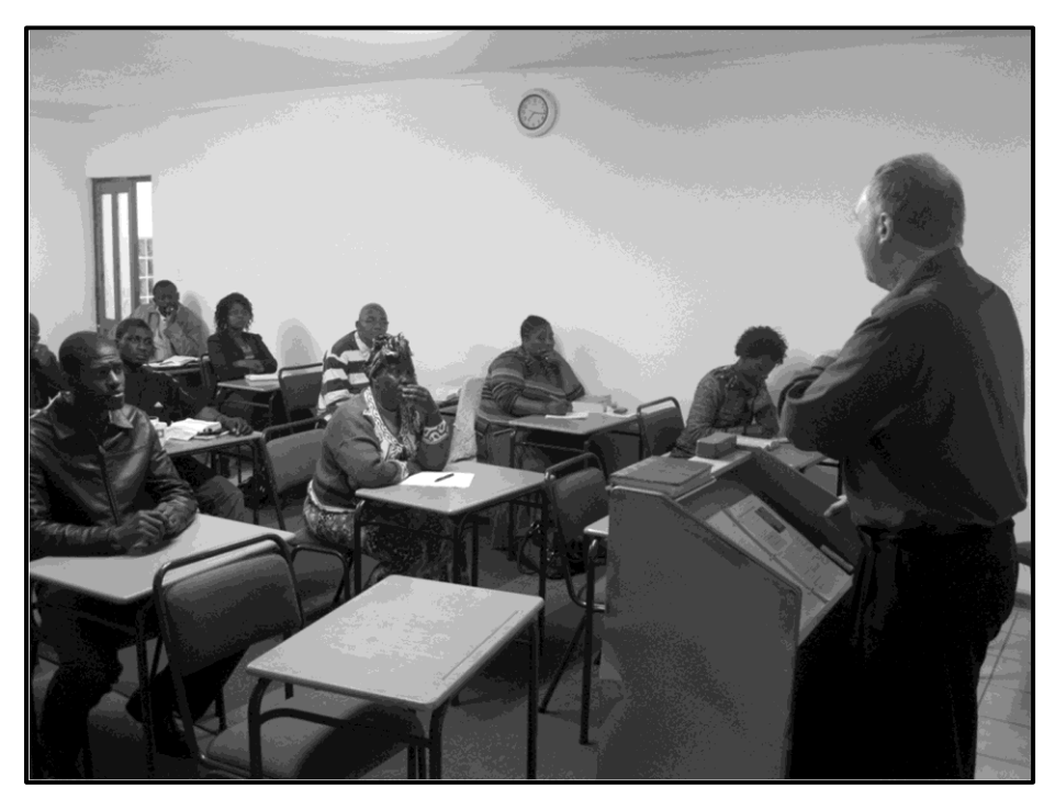
A classroom at Africa Theological College, Khayelitsha, South Africa