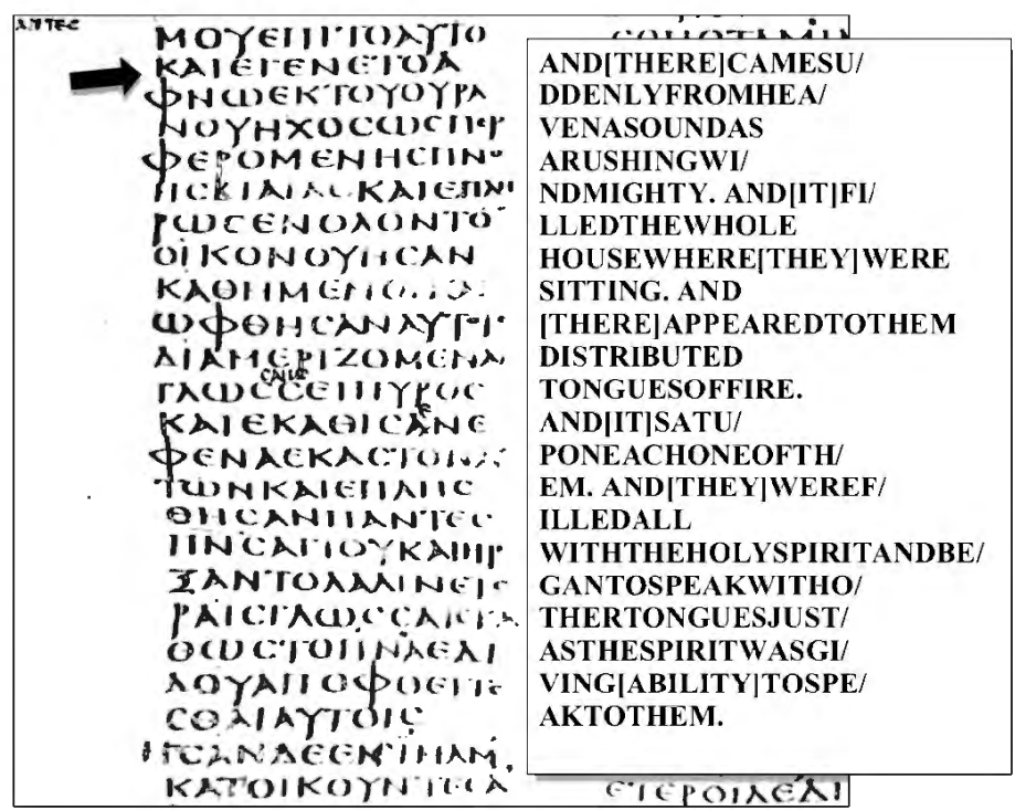
Fig. 4. Acts 2:2–4 in Codex Sinaiticus.<sup>15</sup>

In regard to Acts 2:2-4, could the chiastic structure have been utilized for aid in memorization? The density and symmetry would certainly lend to its use as a mnemonic device. But how does one determine whether it was ever used this way? It is impossible to assert one way or another. Perhaps Luke was not the originator of the chiastic structure and the dense arrangement in Acts 2:2-4 was present in an earlier source that Luke utilizes. In this case, the arrangement might reflect an early Christian formulation of the Pentecost event that was easily memorized. Again, it is impossible to prove. It seems that the case for Lukan origination of the chiastic arrangement is more compelling, however, as the following paragraphs will attempt to show.