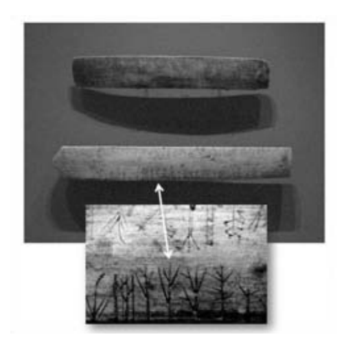
Fig. 4: Potawatomi Prescription Sticks, Wisconsin or Kansas (c. 1850), Nelson-Atkins Museum, Kansas City, MO

Such memory aids stand in fact on a trajectory that culminates in the creation of written language; and to the extent that they serve to relieve a person of the task of having to remember everything they actually weaken memory. Such a thought occurred to me very vividly as I reflected on the two Potawatomi Prescription Sticks now housed in Kansas City's American Indian Collection (fig. 4), accompanied by the following description: