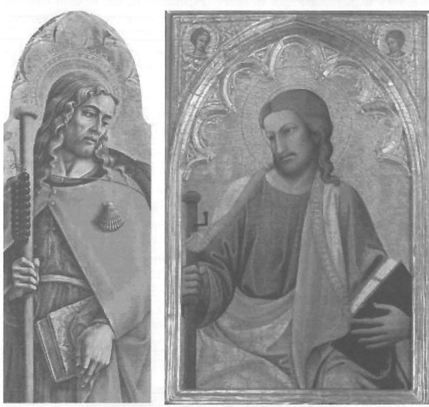
Fig. 5: Left: Carlo Crivelli, James the Greater , from the Polyptych of Monte San Martino (c. 1480) // Right: Antonio Veneziano, James the Greater (c. 1384), Gemäldegalerie, Berlin

Quite often we encounter portrayals of James son of Zebedee with the scallop shell but with the hat thrown back off the head, as in the following example by Carlo Crivelli, or gone altogether, as in the following example by Antonio Veneziano (both Fig. 5).