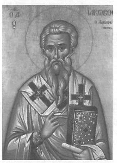
Fig. 15: James the Brother of Jesus (Adelphotheos)

Several things that Tabor says about this painting are true. Whether intentional or not the apostolic figures in the side panels clearly do appear more interested in one another than in the figure of Christ in the central panel. Furthermore it may even seem that one or both of them are regarding the other with a jaundiced eye. What Tabor says about some of the other details of this triptych become more conspicuously true when viewing the original in color. The similarity of clothing between the figures of Jesus and James is indeed striking. Their clothes are the same color (maroon garments with blue cloaks), but so is their hair (light brown). In