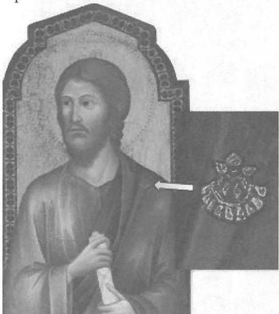
Fig. 16: Scallop shell on the cloak of James the Great.

This should not surprise us, since, as the title of the triptych Tabor discusses as given by the National Gallery indicates, the figure being depicted is not James the brother of Jesus but James the son of Zebedee.