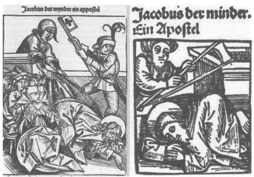
Fig. 11: James the Less being martyred with a hatter's bow in successive editions of the Nuremburg Chronicle . Unstrung on the left (1493), stung on the right (1496).

Depictions of James being beat to death with the hatter's bow sometimes show the bow as strung other times not, as can be seen for example in successive editions of the Nuremburg Chronicle (Fig. 11).<sup>14</sup>