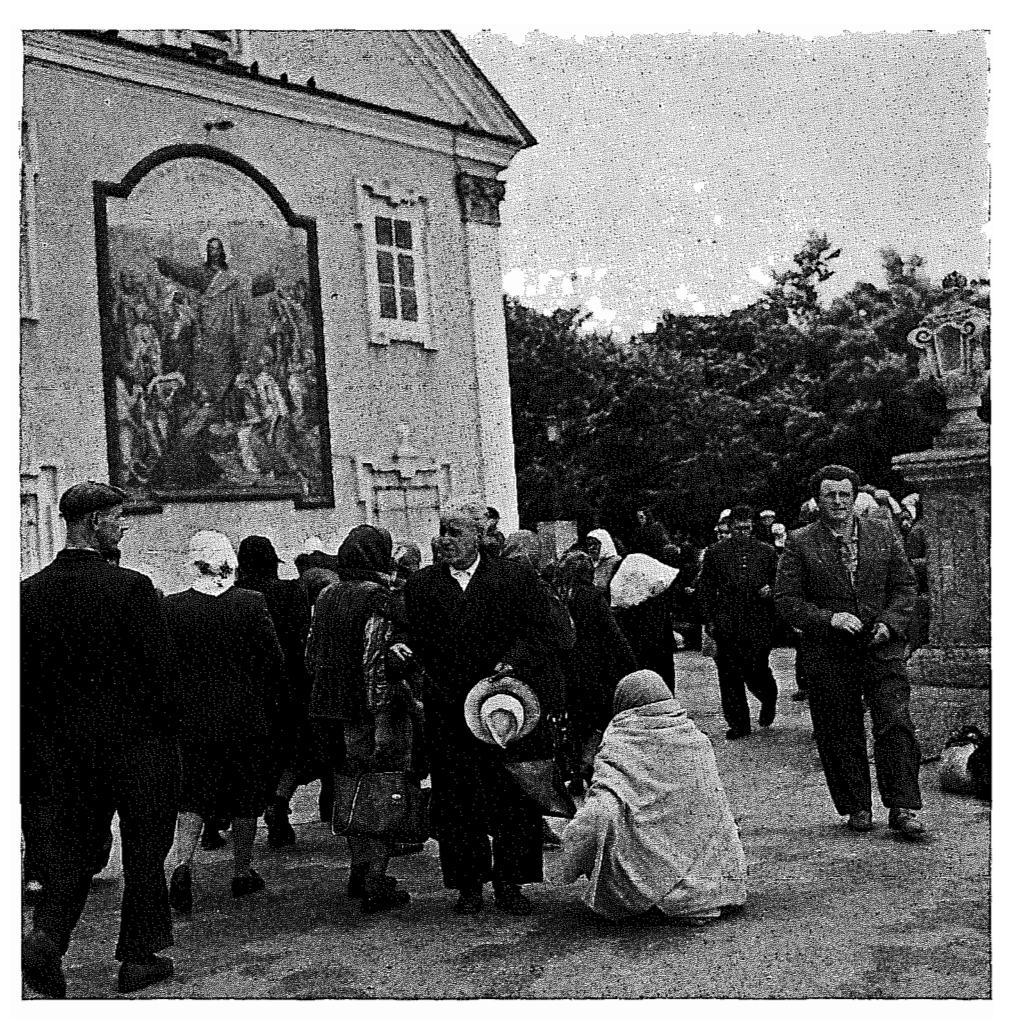
Pilgrims flocking to the Pochaev Monastery in the Ukraine which continues to be a living spiritual centre (see Monasticism in the Soviet Union p.28).

Right The early sixteenth century bell-tower at the Pskov Monastery of the Caves.