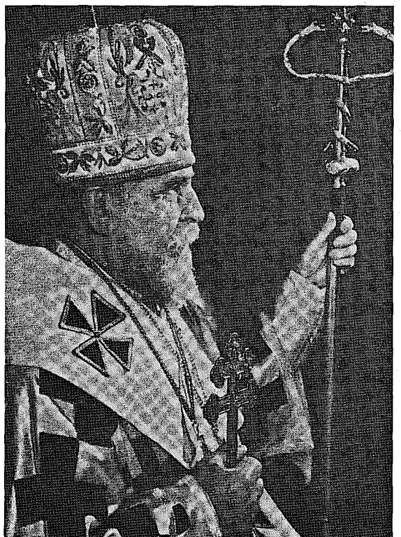
Metropolitan Josyf Slipyi, Archbishop Major of the Ukrainian Catholic Church. He was imprisoned by the Soviet government from April 1945 to January 1963 and named a Cardinal in 1965. (See article pp. 4–12.)