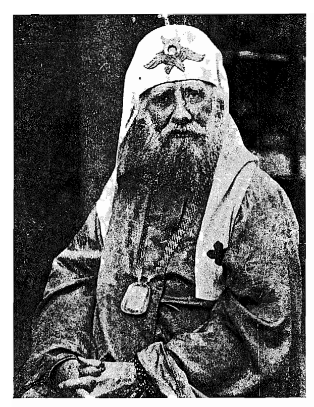
Patriarch Tikhon elected on 5 November 1917 at the Council of the Russian Orthodox Church.