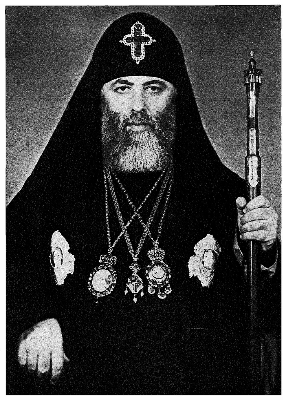
Patriarch Ilya II of Georgia who was elected on 23 December 1977 and enthroned two days later at the Svetitskhoveli Patriarchal Cathedral in Mtskheta. (See documents pp. 262-5)