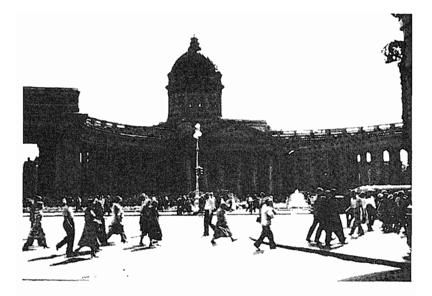
The impressive exterior of the Museum of the History of Religion and Atheism in Leningrad, formerly the Kazan Cathedral (above). Below: the interior, showing some of the exhibitions. See article by Mark Elliott on pp. 124-29.