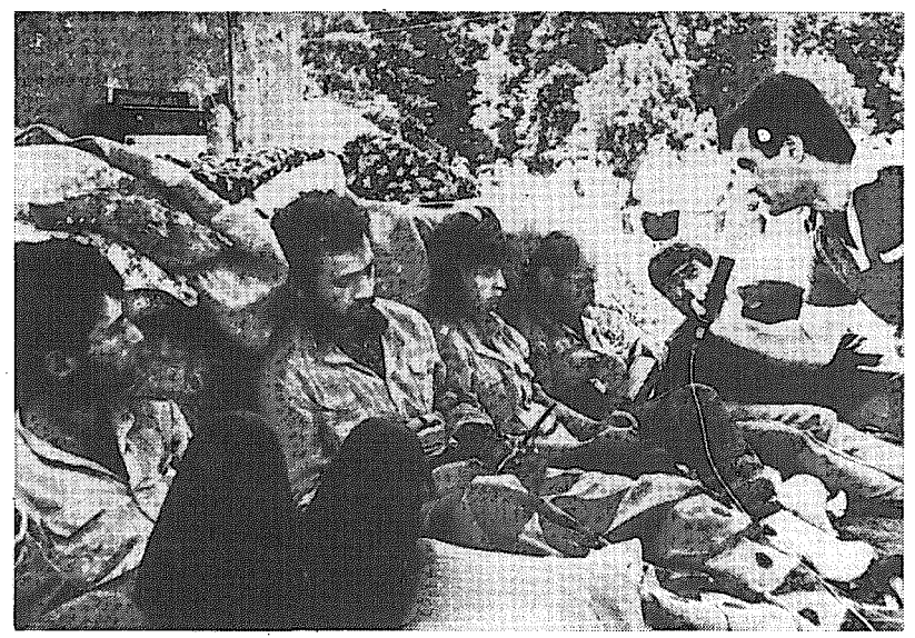
Theatre Square, Yerevan: Armenian students on hunger strike (from 1 June 1988) for the return of Nagorno-Karabakh to Armenian jurisdiction. They are being interviewed by a journalist from an official Armenian newspaper. The interview was not published.

Hunger strike in Armenia. See Chronicle item on pp. 252-254.