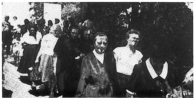
14 August 1988: pilgrims leave the Marian shrine at Nitra.