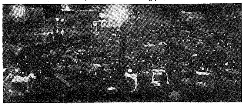
25 March 1988: a demonstration for religious freedom in Bratislava. Participants gather to light candles and sing hymns.