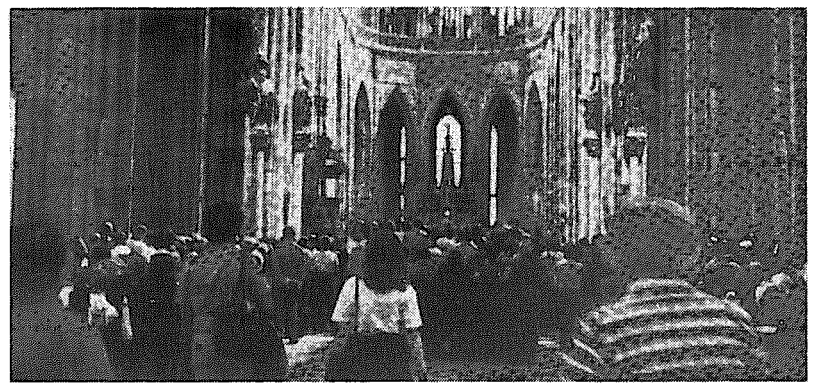
11 June 1988: two new Catholic bishops are consecrated in St Vitus' Cathedral, Prague.

See Chronicle item on pp. 148-50, and Documents on pp. 165-69.