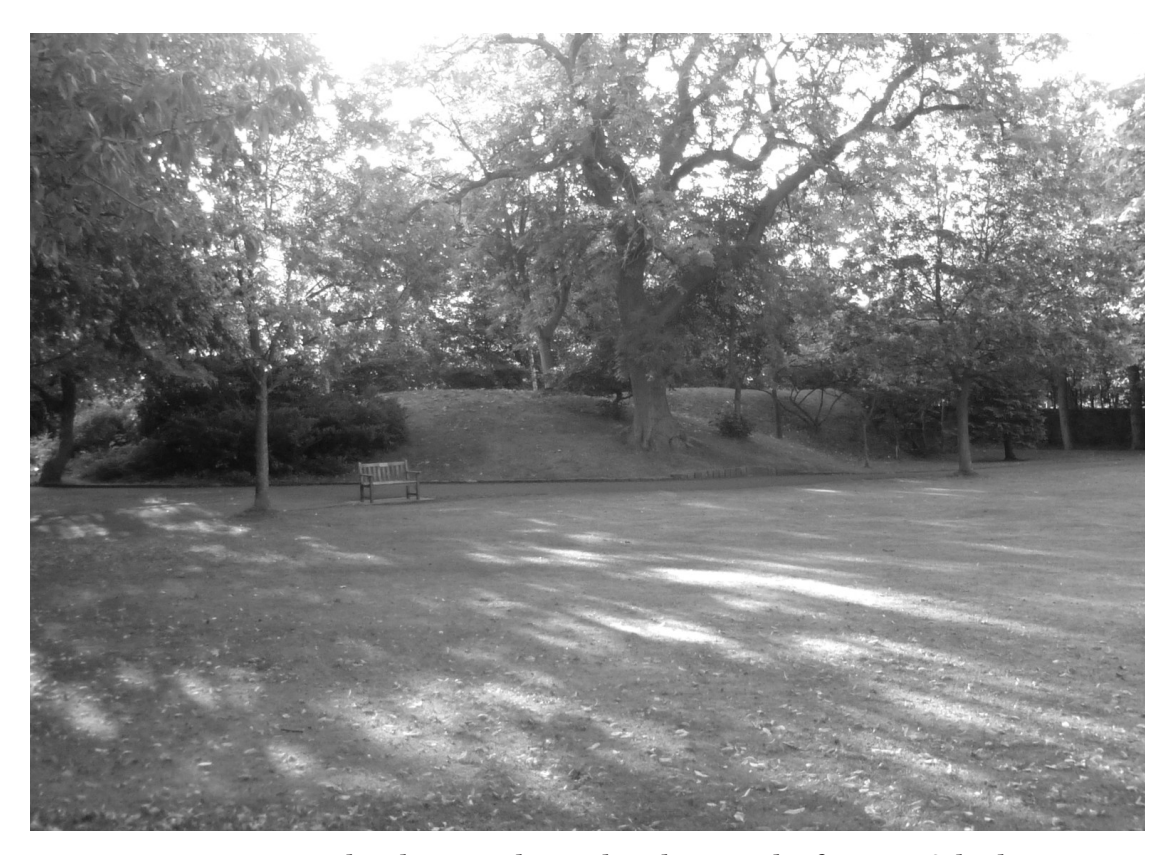
Loretto Mound – the Mound is within the grounds of Loretto School. A straight stone passage runs under the Mound, which is popularly associated with "Our Lady of Loretto".

Scotland. The monks [of Loretto] felt that something had to be done to restore their prestige. It came to their knowledge that a lad long known in the town as blind was not really so. The lad's mother, a gypsy, had, since he was an infant, taught him so to turn up his eyes that he could for hours on end deceive experts and make them believe that he was blind. This discovery came to the monks as an inspiration and they determined to use it for the purpose of pretending to perform a public miracle.