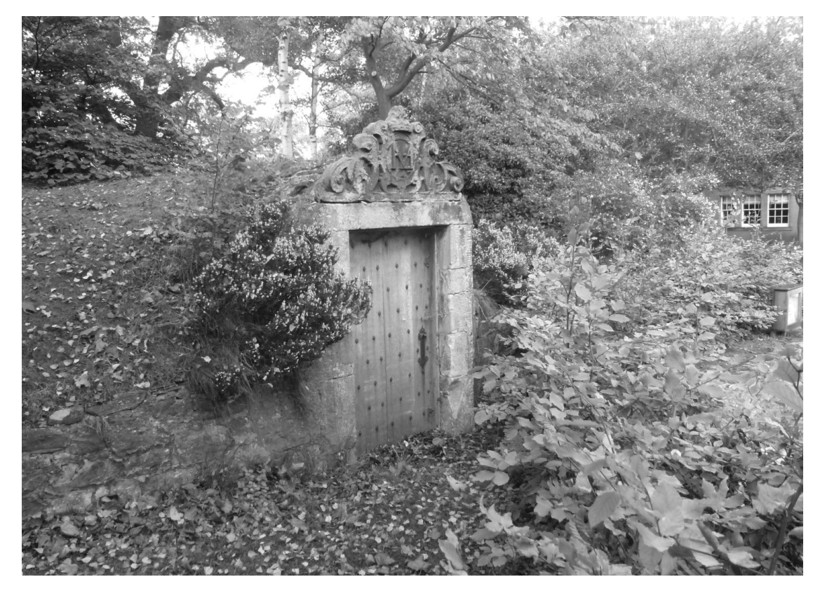
The door which opens into the Mound. Over the entrance is the pediment of a dormer window, dated 1647, which is said to have come from Pinkie House.

was that over a large area of the Lowlands of Scotland the Roman c were credited with having performed a genuine miracle.