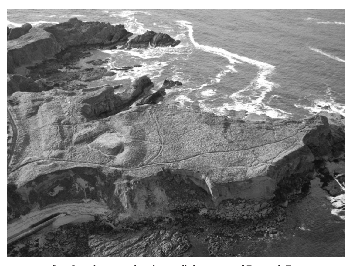
Seen from the air, earthworks are all that remain of Eyemouth Fort.

fabricator a hundred years later. The fort at Eyemouth was built by the French in 1557 with the intention of mounting an attack on the English stronghold at Berwick.<sup>25</sup> It was agreed at the Treaty of Cateau-Cambrésis in April 1559 that it should be cast down, but, not surprisingly, this did not happen, and the fort was still standing in September 1560.<sup>26</sup> Bothwell landed from the continent at Eyemouth in 1565, presumably on his way to Crichton Castle.<sup>27</sup> In September 1559, the Queen Regent controlled the south side of the Firth of Forth and the Protestants the north side, so possibly it was prudent to land at Eyemouth to avoid any trouble, particularly if there was anything valuable in the cargo. Three French ships did arrive in Leith in September 1559 but they had the protection of 800 soldiers on board.<sup>28</sup>