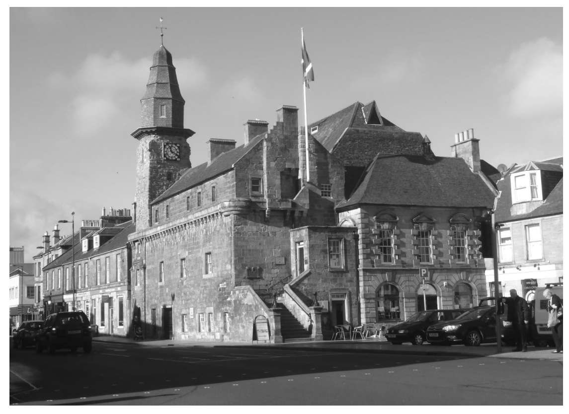
Musselburgh Tolbooth, built in 1590 - one of the oldest in Scotland to survive intact.