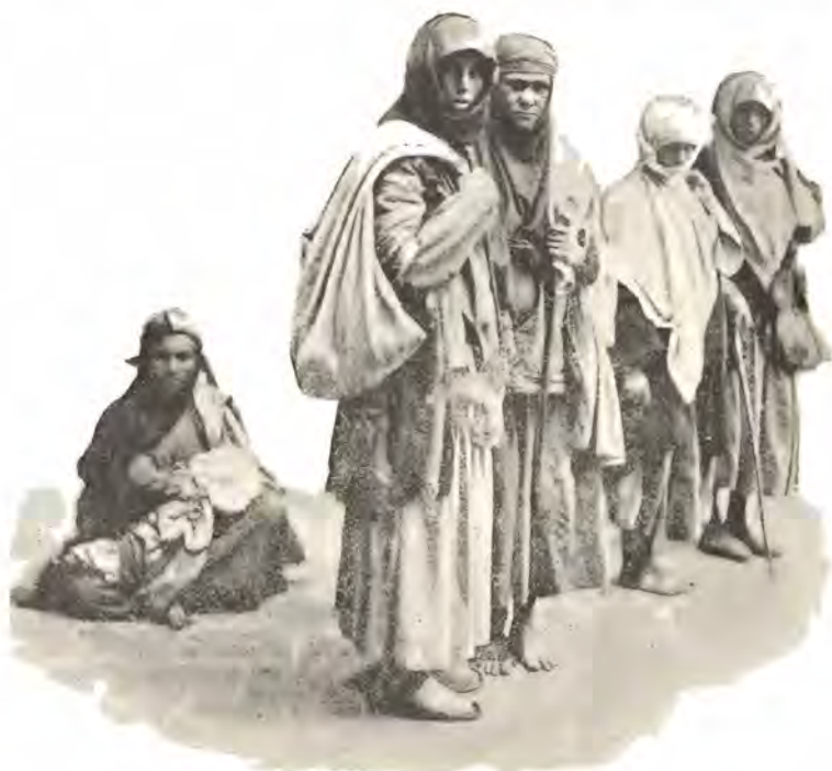
GROUP OF PERSIAN WOMEN OF A WANDERING TRIBE.

saying they had never had any in their own language before. At Kharzan, a village high up on the Elburz Mountains, many sick people were brought to us. Both they and their friends were very ignorant of their own religion, and therefore willing to listen to "the Old, Old Story," so new to them. The mullā accepted a Gospel and tracts, which we saw him reading to a little group of friends. We shall never forget Jubilee Day, June 20th, 1897, which we spent there. At day-break all the outlines of the mountains were indefinite and hazy; then as the sun rose above one of the mountains, each