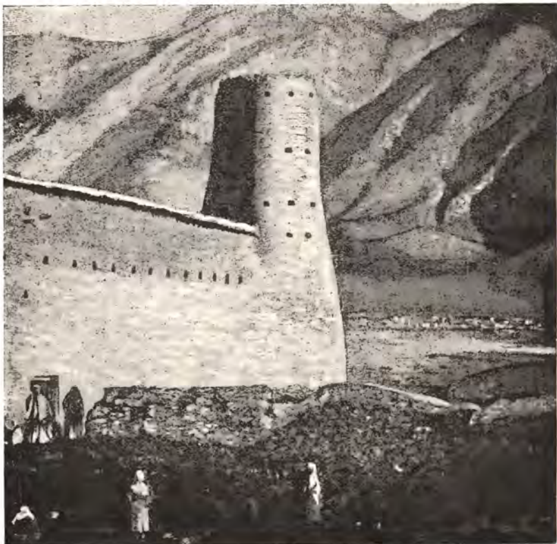
WALL SURROUNDING A VILLAGE.

We learnt that representatives had been to Isfahan for an order to have Sakiñeh given up to them, and failing to obtain