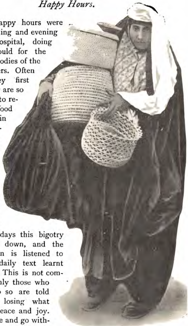
PERSIAN WOMAN IN OUT-DOOR DRESS. (A Basket-seller.)

Many happy hours were spent morning and evening at the hospital, doing what I could for the souls and bodies of the poor sufferers. Often when they first arrive they are so bigoted as to refuse to eat food prepared in the hospital, or to drink water from the well in the courtyard, lest they should be defiled. Generally in a few days this bigotry is broken down, and the Bible-lesson is listened to and the daily text learnt willingly. This is not compulsory, only those who do not do so are told they are losing what gives us peace and joy. Many come and go without any change of heart,