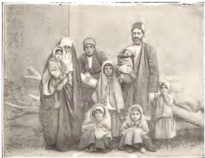
A PERSIAN FAMILY.

In St. Matthew vii. 15—20 our Lord tells us plainly how the false is to be distinguished from the true: "the good tree bringeth forth good fruit." Which religion brings forth good fruit, Christianity or Mohammedanism? Listen to the testimony of two Moslems, one a man, the other a woman. The former said, "Show me what your faith does. You say you do not believe in works of supererogation nor in pilgrimages; your faith does nothing." After hearing of the "expulsive power of the new affection," and the fruit of the Spirit, he exclaimed, "Love, mercy, truth, purity, we talk of these, but have not got them." The woman asked for St. Matthew vii. to be read to her; verses 19 and 20 struck