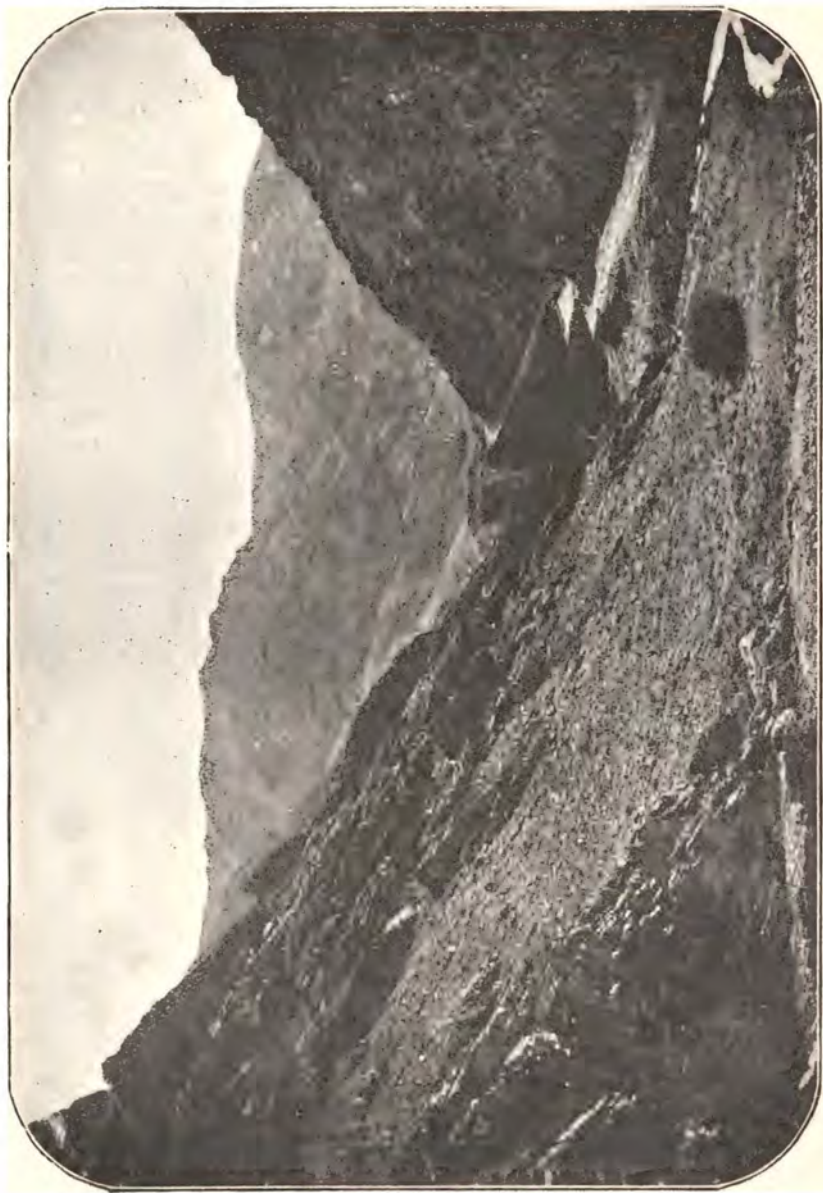
A PASS IN THE MOUNTAINS.