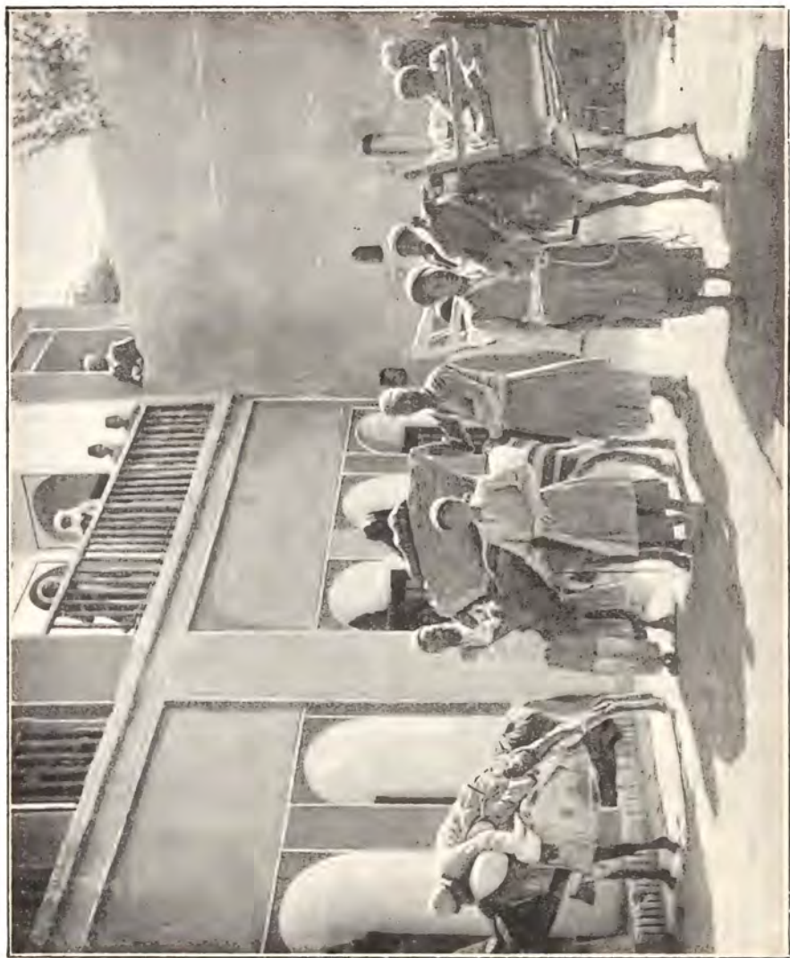
PATIENTS ARRIVING AT JULFA HOSPITAL.