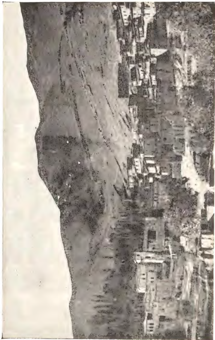
A PEKSIAN VILLAGE.