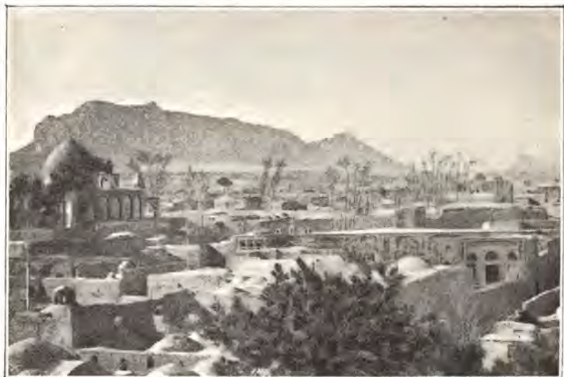
A VIEW OF JULFA.

for some time, so that that work was in abeyance, and work among Moslem women had not been begun. After studying the language for some months, I began to seek openings among the women, but the door seemed closed. Three little girls said they would come for reading and knitting lessons, but they were soon frightened away by the mullā telling them it was bad for them to learn to read before they were married. Shortly after, several women asked to be shown how to knit gloves; only two persevered, still it was something to have admission to two houses where one nearly always found neighbours ready enough to talk, though not so fond of listening! During this waiting-time, when praying to God to unlock some door, He granted an answer in a most unexpected manner. Going up the street one day, I noticed a poor woman crying bitterly. Knowing she was the mother of some children who were very friendly with me, I