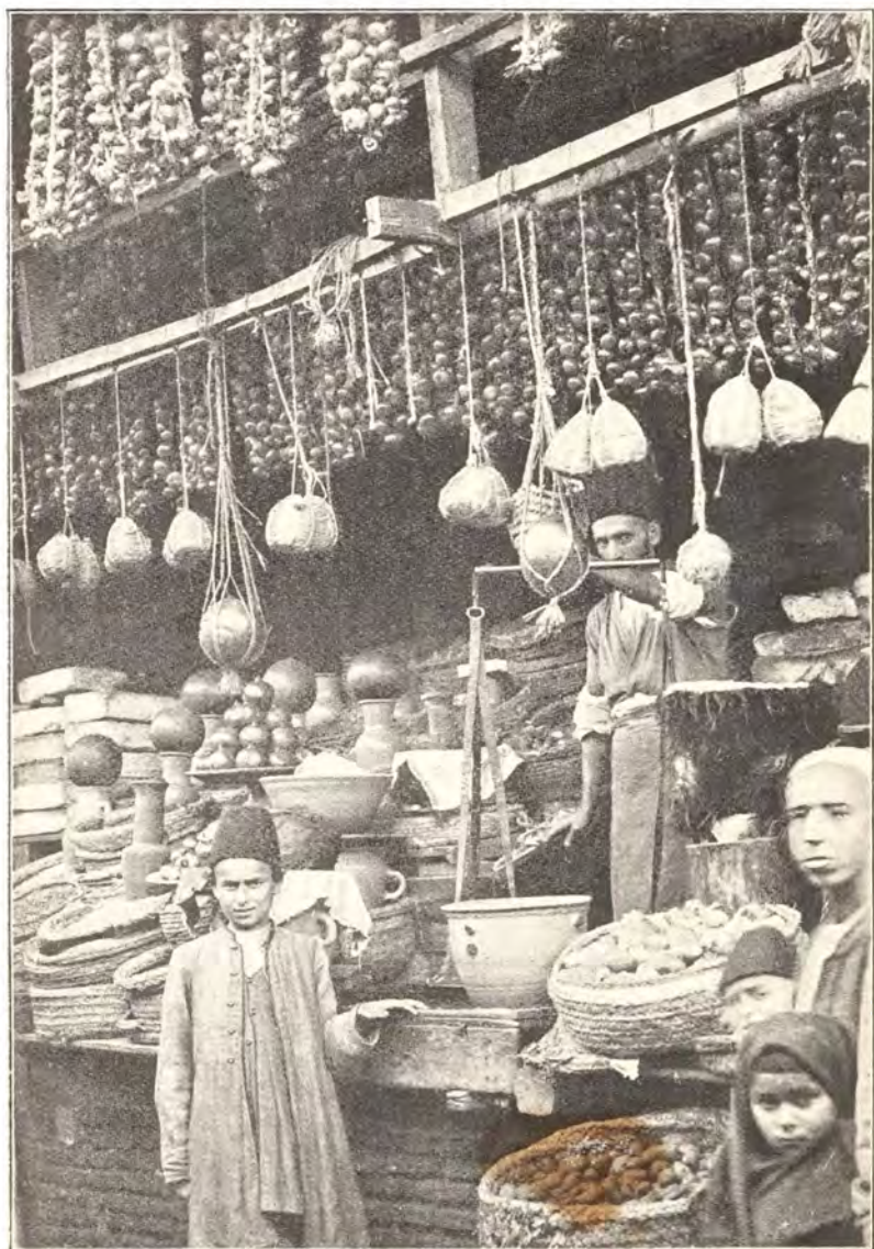
A PERSIAN FRUIT SHOP.