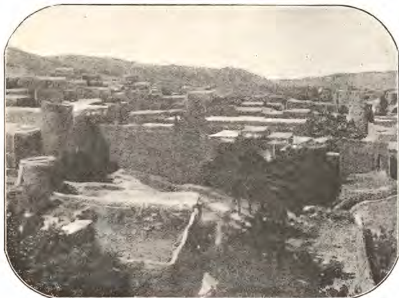
VIEW OF SOH, A TOWN OF PERSIA.

It is on this very account that all Christians ought specially to pray and use every means in their power to take away the stumbling-block put by early Christians in the way of those who were, like the Zoroastrians, seeking after "light, more light." We have indeed need to pray in the words of the Communion Service, "Have mercy upon us, most Merciful Father; for Thy Son our Lord Jesus Christ's sake, forgive us all that is past." Our spiritual forefathers were "verily guilty"; are we less so? Freely we have received, have we freely given the Gospel light to the 175,000,000 of Moslems?