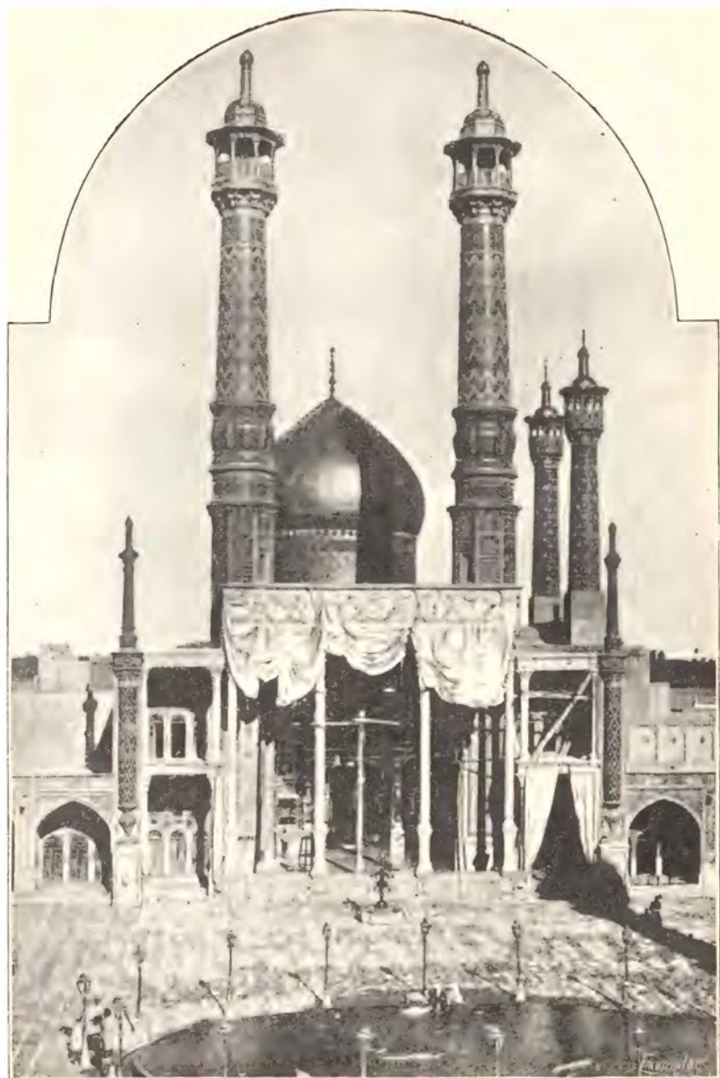
MOSQUE AT KŪM.