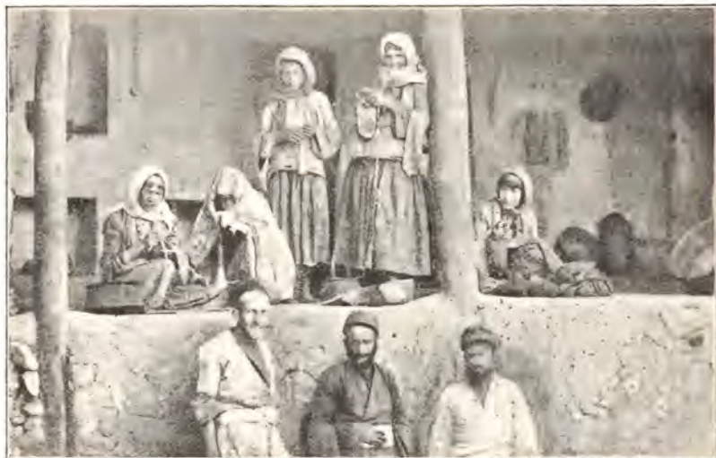
INTERIOR OF VILLAGE HOUSE—WOMEN SPINNING AND KNITTING.

followed me from the street into a large courtyard, and were sitting quietly listening to the Gospel, when a very old woman came in, asking if the foreigner were there. Being answered in the affirmative, she said, "I have come to see the lost one." Coming close and peering into my face, she added, "Till you believe on Ali * you will never go to heaven." I replied, "I thought heaven was God's abode." "Perhaps, but until you accept Ali you can never enter there."