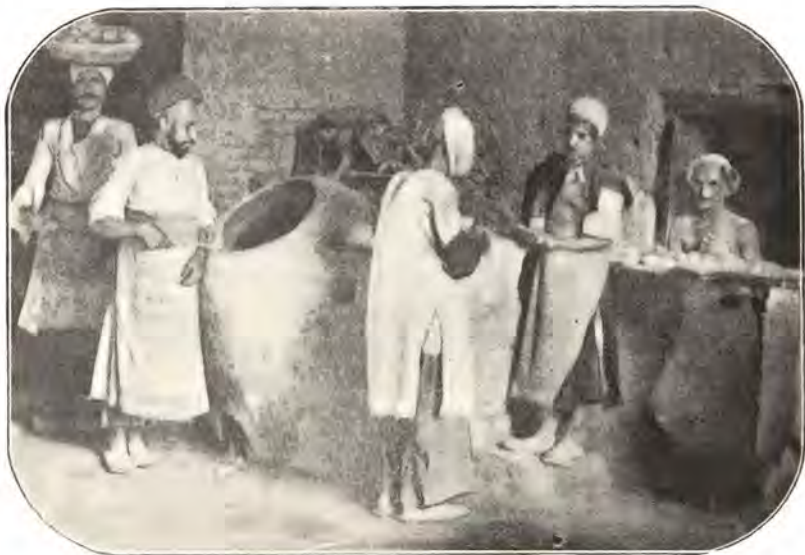
BREAD-MAKING AND BAKING, PERSIA.

The poor patient was in a very bad state. All I could do was to dress her terrible wounds, and try to make her more comfortable. Then, sitting beside her, I asked if I might read to her. She turned her head away. "No, I am too miserable to listen." But when she heard that the Bible