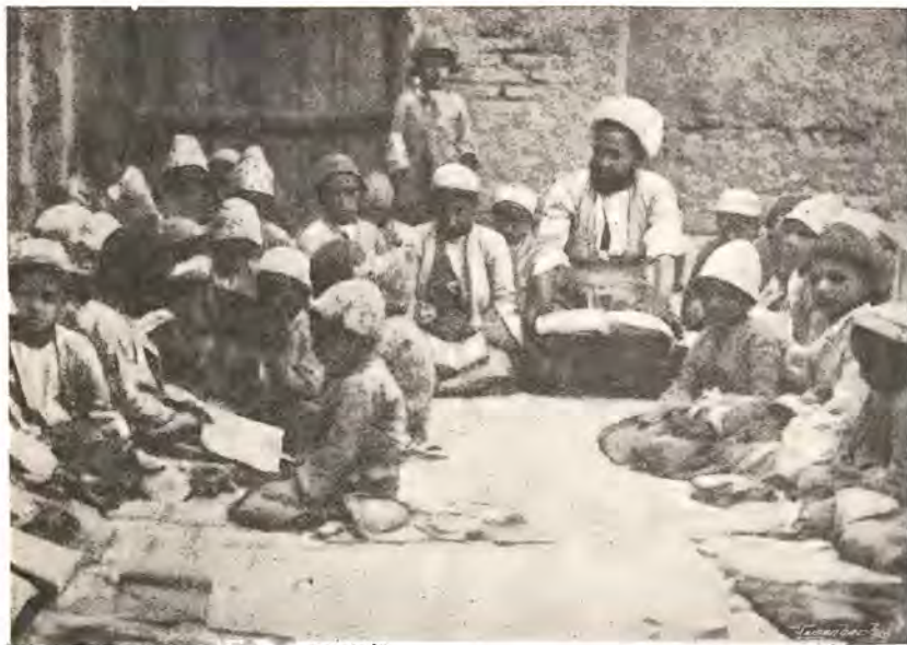
A MOHAMMEDAN SCHOOL.

Our Lord's dying prayer for His enemies rings down through the ages as sadly true to-day as when first uttered: "Father, forgive them, for they know not what they do." Will you too plead with our Father, "Forgive them ," and "mercifully forgive the sins of Thy people ," for they have failed to keep the sacred trust Thou didst commit to them;