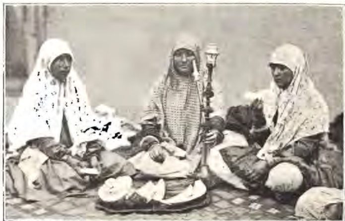
SMOKING THE KALIĀN.

Seated on a rich velvet cushion, fanned by her slaves in a beautiful room, was a wealthy lady. The walls of the room were all covered with tiny arches and honeycomb pattern, shaped while the mud plaster of the wall was still soft, and painted in rich colours, crimson, blue, green, gold, purple, all blended in true Eastern style, studded with small stars,