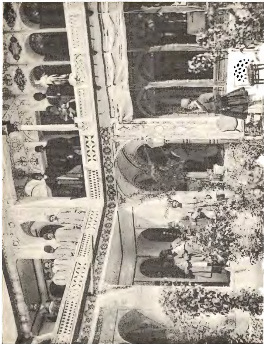
INTERIOR OF WELL-TO-DO PERSIAN HOUSE.