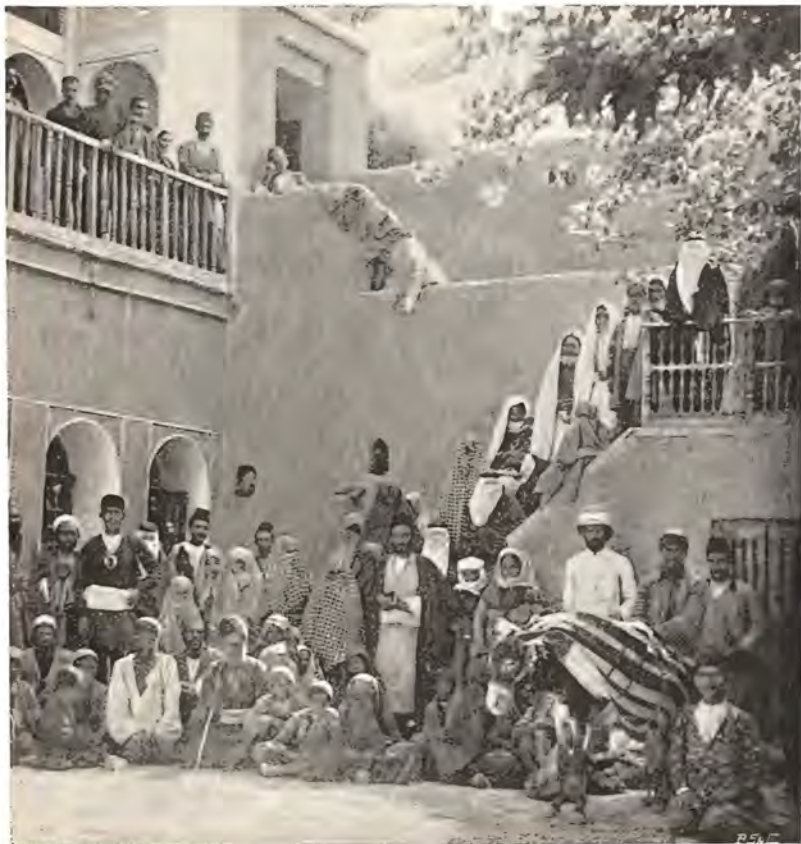
A GROUP OF PATIENTS AT THE HOSPITAL.

of a dome," i.e. it echoes back, which proved true. This prohibition, like subsequent ones, proved to be no advantage to our opposers, but rather for us, advertising the work, so that when the order was withdrawn the women came in much larger numbers. When visiting this same mullā's wife some weeks afterwards, she spoke quite openly of the