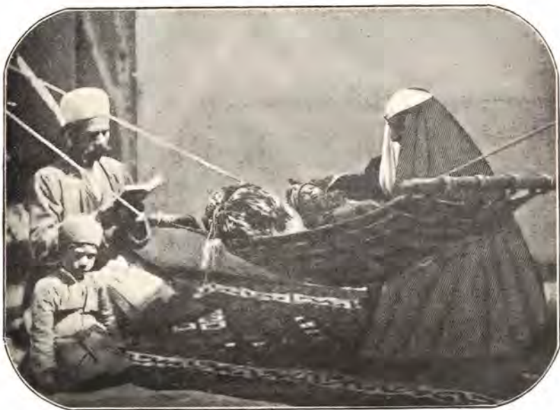
A PERSIAN FAMILY.

Very different from this was the case of another villager who had asked for reading. When I inquired if there were any particular passage she wished for, her husband, sitting outside in the courtyard, out of sight though not of hearing,