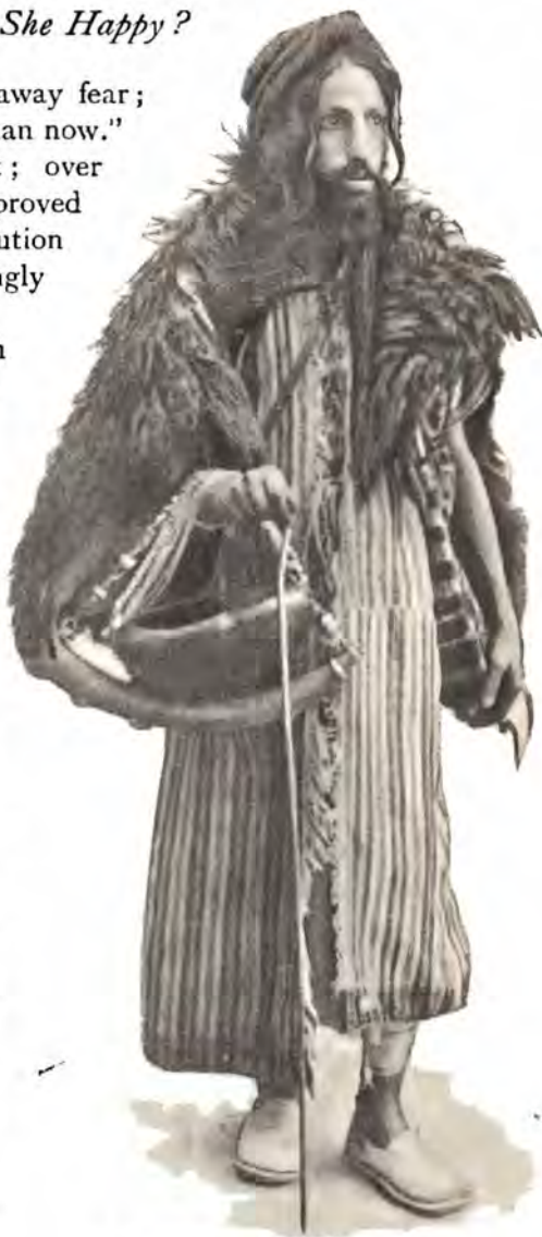
A BEGGAR IN A STREET IN PERSIA.