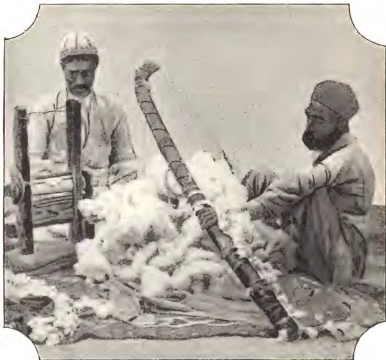
BEATING OUT COTTON WOOL.

But our object in visiting Isfahan is not merely travellers' curiosity, but a desire to see what the Lord is doing and how His cause is being promoted there.