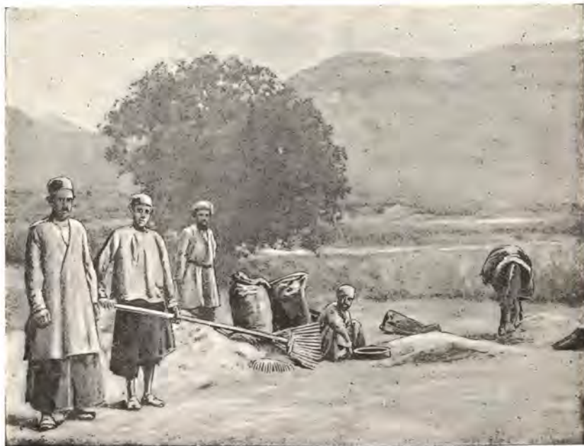
IN THE HARVEST FIELD.

hold of the handle, they swing the stone round ; the flour falls over the edge of the lower stone into a sheet spread beneath it on the ground. The "watered garden," fresh and luxuriant ; whereas the "garden that hath no water" is parched and withered. The cornfields, the reapers, not stacking the corn, but making a great heap of it, which is gradually spread on the ground, when a many-bladed instrument, drawn by a donkey, chops it up ; the man, "whose fan is in his hand," standing ready to throw up the chopped wheat, so that the chaff may be blown away, while the grain falls at his feet. The shepherd with the lamb carried on his shoulders. The lengthy salutations. No wonder our Lord,