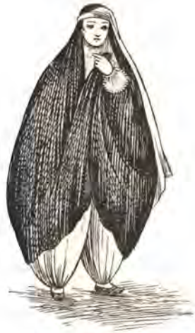
A PERSIAN WOMAN.