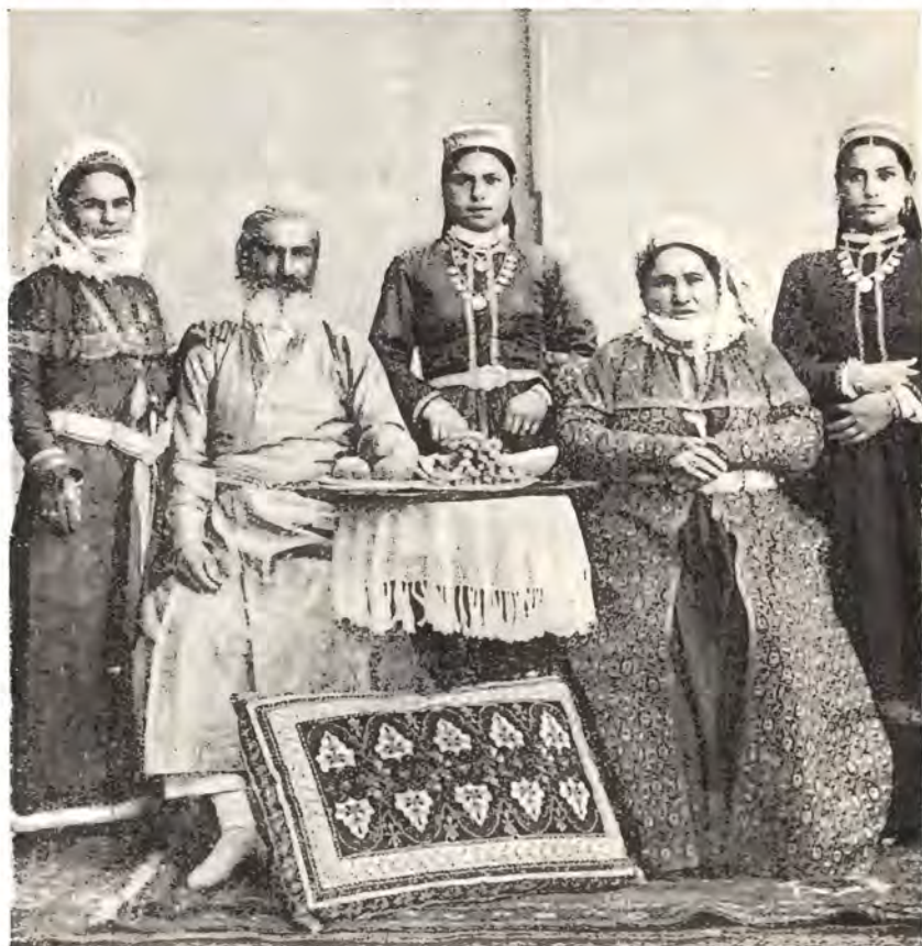
A GROUP OF ARMENIANS.

would be none of the old difficulties to contend with. We have already considered the case of those with whom one comes in contact for a brief half-hour when travelling; those lost and scattered sheep without any shepherds to call them back to the fold. But even where, as at Julfâ, a Mission station has been established for twenty-eight years, and work