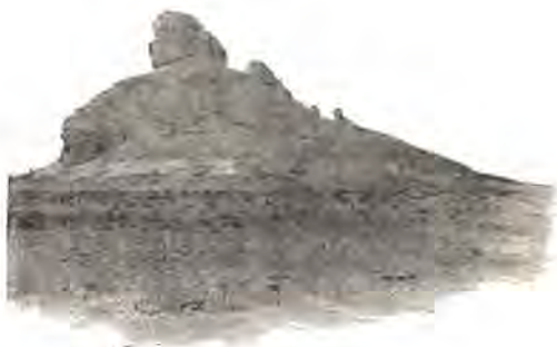
A ROCKY PEAK NEAR JULFA.