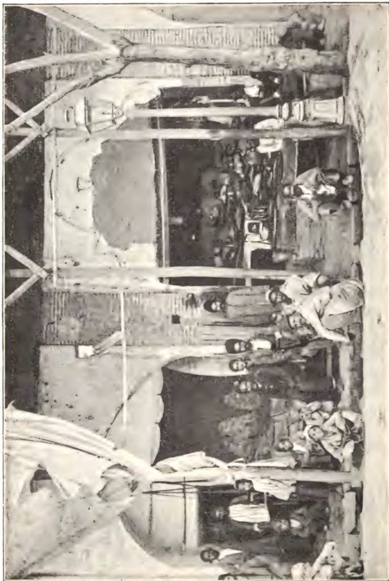
BAKERS' AND GROCERS' SHOPS.