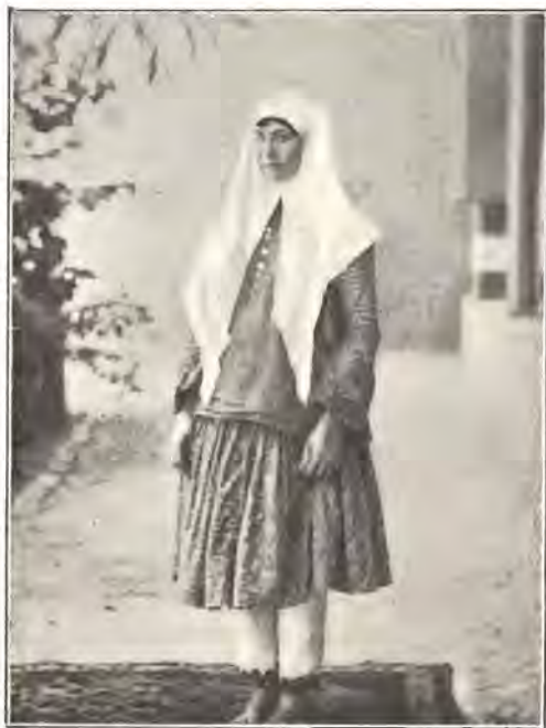
PERSIAN VILLAGE WOMAN IN HOUSE-DRESS.

When it is over, the men who during this sacred time have not shaved their heads nor cut their nails, to show that they have been oblivious to all earthly concerns, now do so, burying the hair and nails in the valley before returning to the world. The farewell visit to the Ka'abah is paid, and the great pilgrimage is over. Its effect, according to the Arabic proverb, is, "If your friend has been to Mecca, trust him not. If he has been there twice, avoid him. But if he made the pilgrimage the third time, flee from him, as you would from Satan."