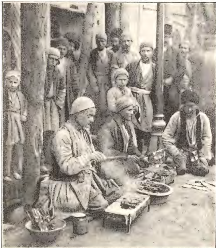
COOKING IN THE STREET IN A PERSIAN CITY.

very much persecuted lately. No less than four times she has been beaten by her uncle ; he keeps on trying to force her to be married, and she steadily refuses. She yesterday returned a ring that was given her, and I quite expect she will pay for it, but her courage keeps up. She says they may beat her or kill her, but she will not marry a Moham-