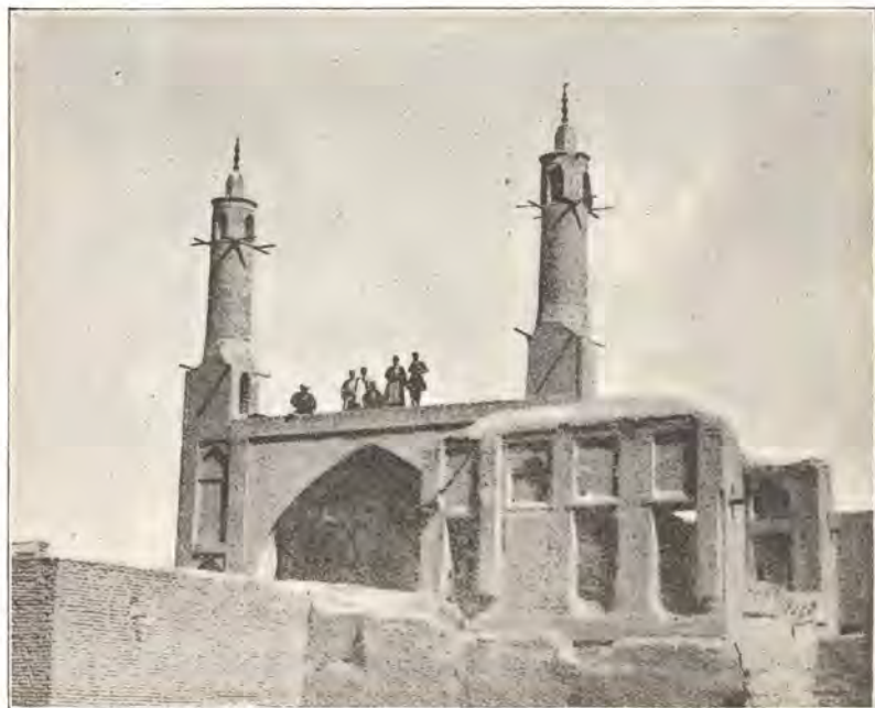
MINARETS OF A MOSQUE FROM WHICH THE CALL TO PRAYER IS CHANTED.

II. Prayer. Moslems are bound to repeat their prayers five times a day: at daybreak, noon, before sunset, during the short twilight, and an hour after night has begun. The first sound at daybreak in a Moslem land is the solemn call to prayer chanted by the Moazzem from the minaret or roof of the mosque. The translation of it is, "God is most great" (repeated four times), "I declare that there is no God but God; I declare that Mohammed is the Apostle of God" (repeated twice), "Come to prayer" (twice), "Come to the refuge" (twice), "God is most great" (twice); adding at the daybreak call, "Prayer is better than sleep," followed by the final declaration of God's greatness.