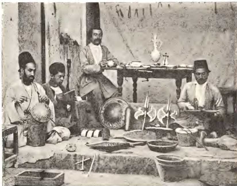
BRASS WORKERS, ISFAHAN.

dominant colour being a rich blue, relieved by patterns in pale blue, gold, white, &c. Oh, when will our King Jesus be worshipped there? Opening out of the market-place are the covered bazaars, extending a mile across the town. They are so picturesque: the vaulted roofs, and the crowded thoroughfares where camels, horses, mules, donkeys, men, women, and children, all struggle to pass each other. The boys and men are fond of bright colours; green, blue, orange, salmon, dark crimson, are all used for coats, and are set off by white turbans. The women wear dark indigo chuddars and long white veils. The former all shout, "Take your foot away," "Watch," "Look out," "Give way." The shops on either