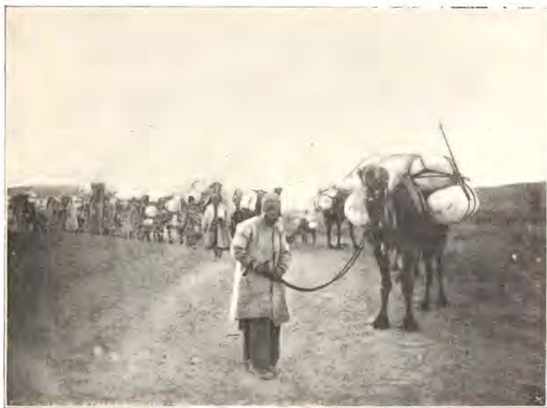
A CARAVAN IN THE DESERT.

no life—God grant that Persians may soon learn that no living water means perishing souls!