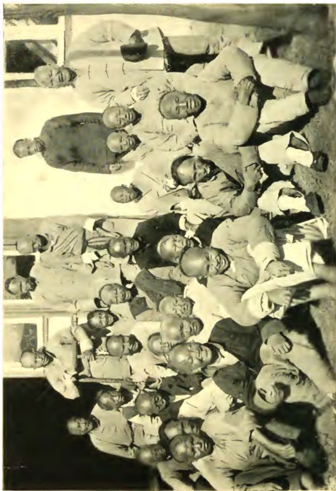
A Group of Christian Lepers.