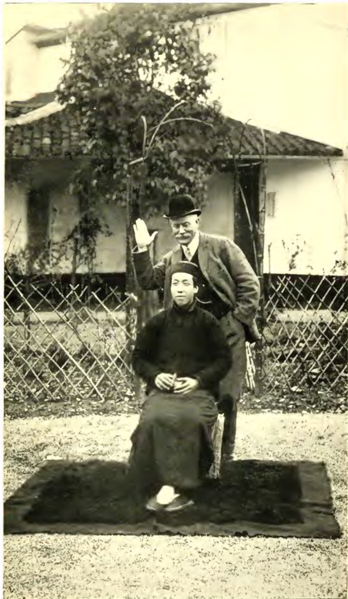
"Cock-a-doodle-doo," now Assistant-Dispenser,