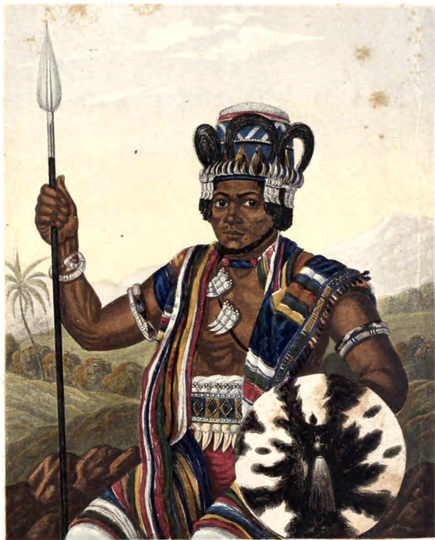
Rafaralahy. Governor of Fovle Point Madagascar.

Printed in Oil Colours by G. Baxter (Patentee) 3, Charterhouse Square