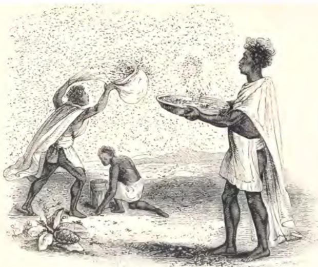
METHOD OF GATHERING AND WINNOWING LOCUSTS USED FOR FOOD BY THE MALAGASY. vol. i. p. 202