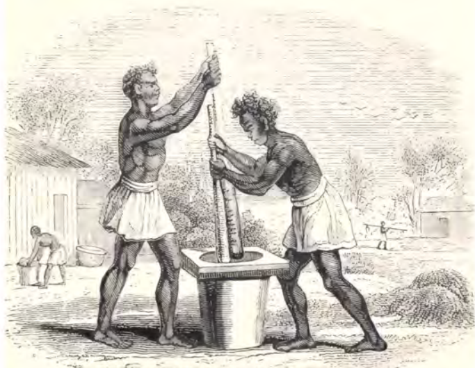
METHOD OF BEATING RICE FOR THE PURPOSE OF SEPARATING THE HUSK FROM THE GRAIN. vol. i. p. 203