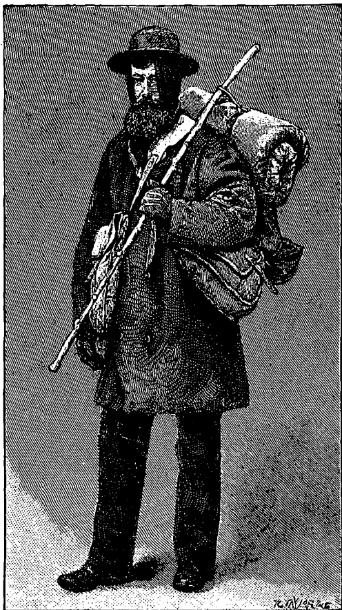
JAMES GILMOUR EQUIPPED FOR HIS WALKING EXPEDITION IN MONGOLIA IN FEBRUARY 1884