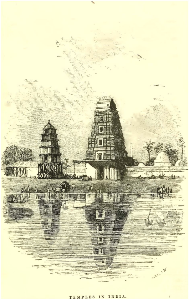
TEMPLES IN INDIA.