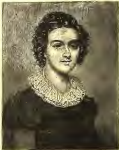
Ann H. Judson